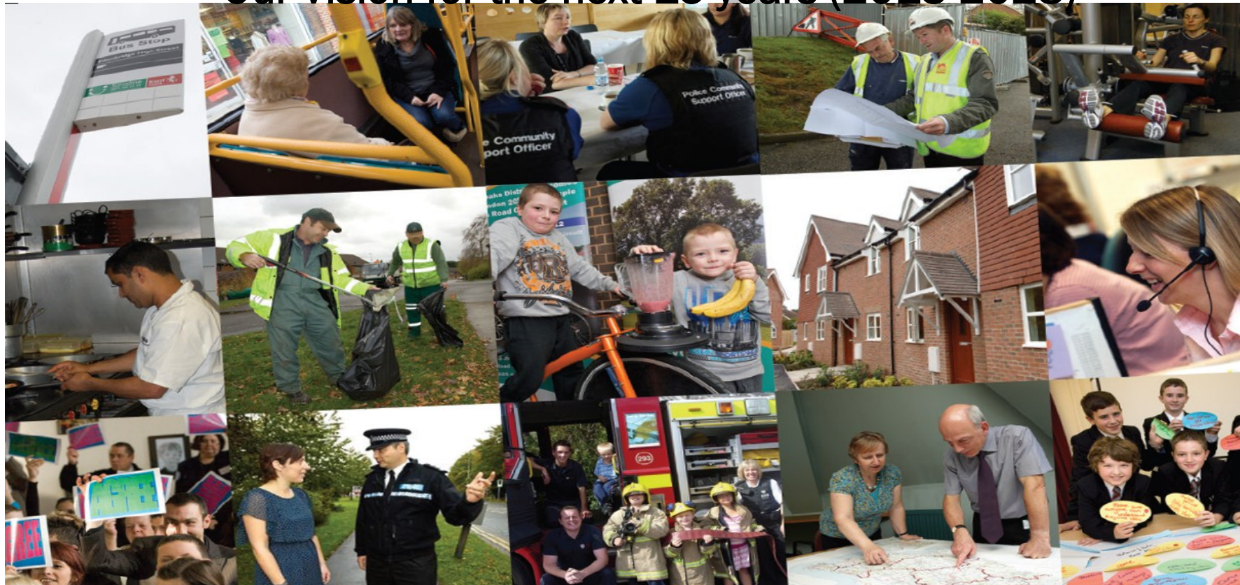
Public Consultation Draft